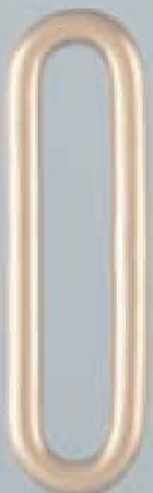
Z6118/30, 35, 40, 50 y 70