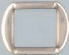
Z6226/16 y 25