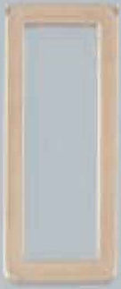
Z6086/35 y 40