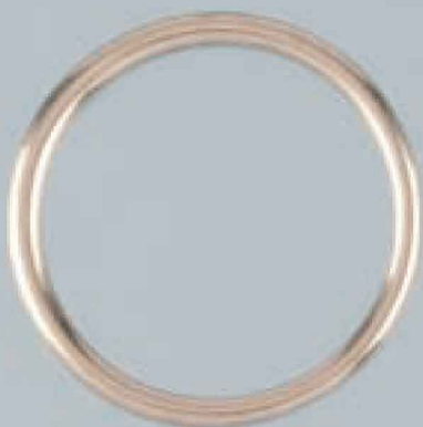
Z6345/35, 40, 50 y 60