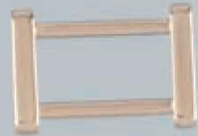
Z6011/15, 20 y 25