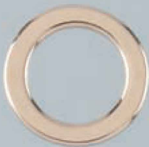
Z6072/10, 16, 20, 25, 30 y 38