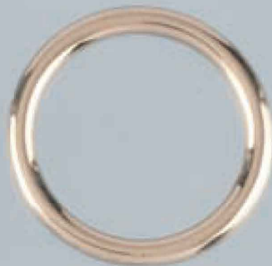
Z6157/20, 25, 30 y 40