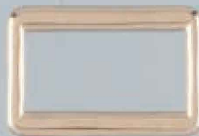
Z6022/25, 30, 40 y 58