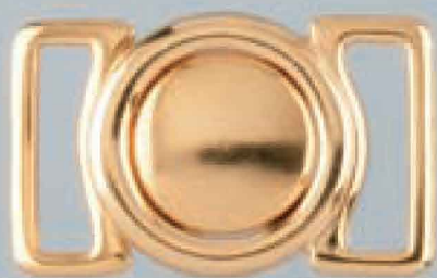
Z866/25, 30 y 40