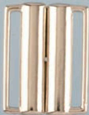
Z6056/30 y 40